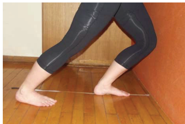
Picture 1. Subject in the position for the Weight-Bearing Lunge Test.

Ankle flexibility or maximal DROM was estimated by performing Weight Bearing Lunge Test (WBLT). See Picture 1.